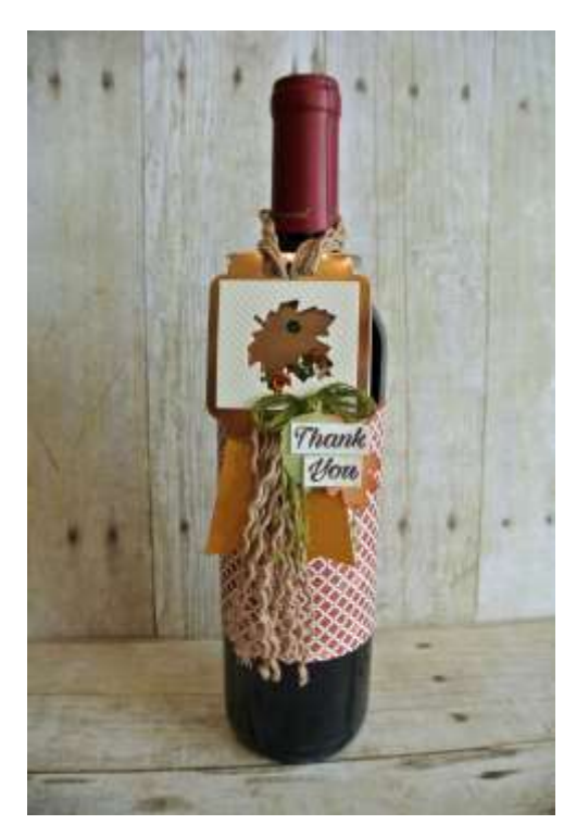
All images © Stampin' Up!®