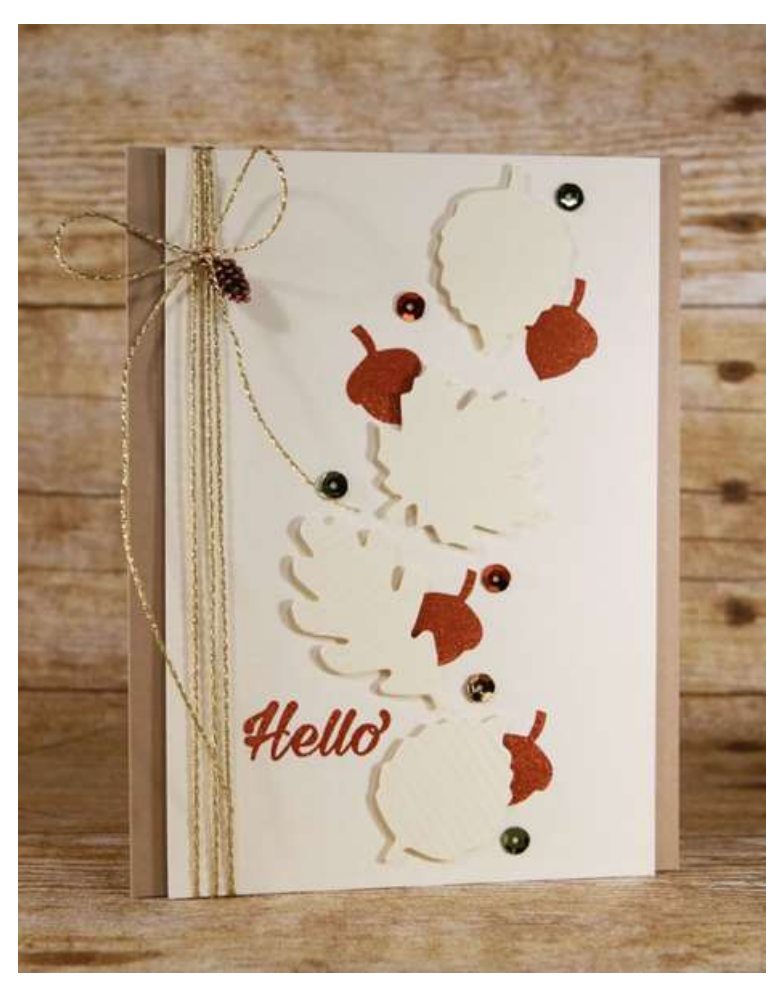
All images © Stampin' Up!®