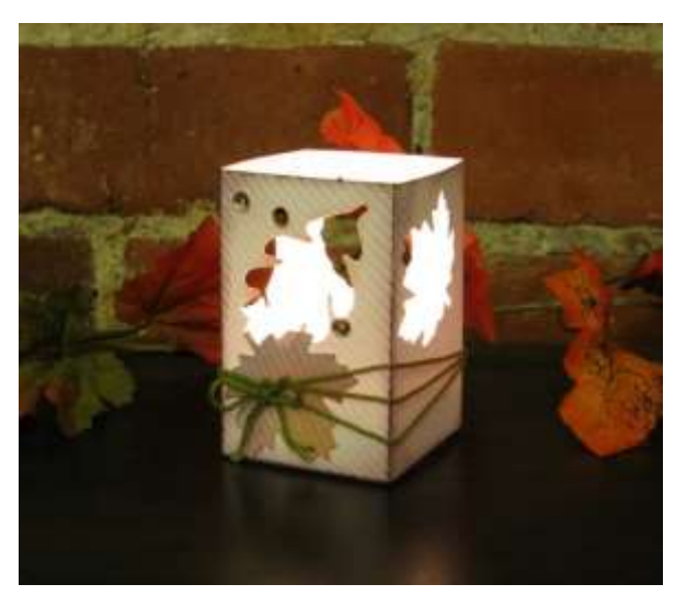
All images © Stampin' Up!®