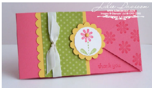
Bold Blossom stamp set