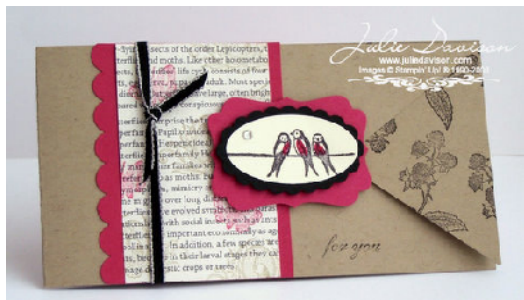
Clearly For You stamp set